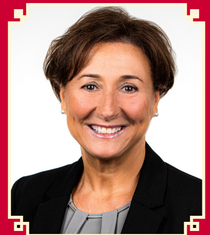
Nonprofit Sector Domenica Foundation